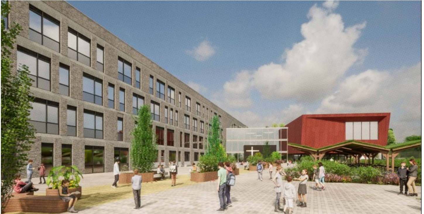
Proposed new building for St Richard Gwyn

The proposal for the new school buildings for St Richard Gwyn are incredibly exciting. It is proposed that St Richard Gwyn Catholic High School will move into the new building by Spring 2025. This is an incredibly exciting development in the history of the school.