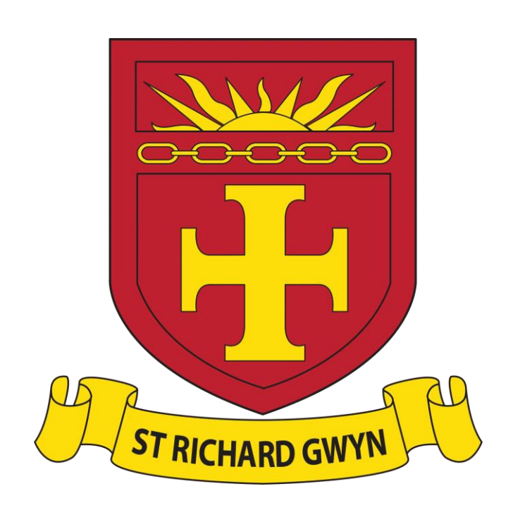
KS4 Curriculum Summary